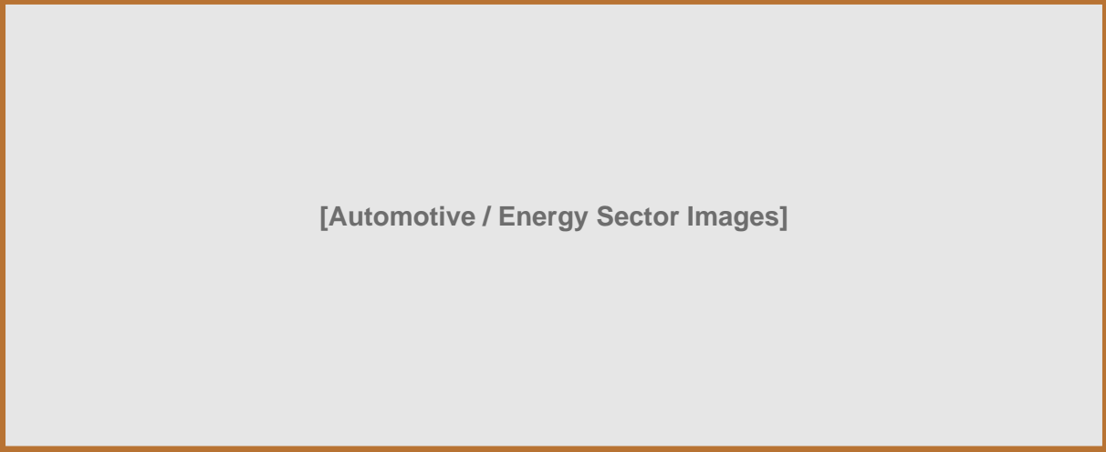
[Automotive / Energy Sector Images]